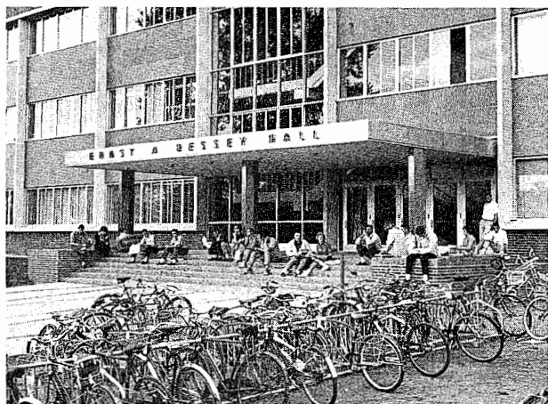
Bessey Hall, one of the modern, air-conditioned classroom buildings in which Communication Arts Institute classes and labs are held.