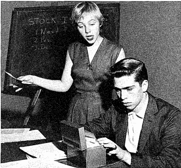
Student debater hits a snag in rebuttal, and colleague scratches for evidence to win the point, in Institute debate series.